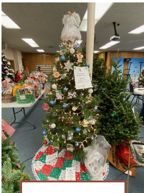
The tree donated by the Lincoln County 4-H Leaders Association.

Please keep this annual event in mind next year. They are always looking for organizations to decorate a treat, create a wreath or donate a basket to this worthwhile fundraiser.