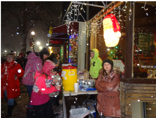
There were live mannequin displays and they handed out coffee and hot chocolate and popcorn.