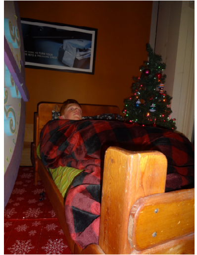
The 4-H Explorers participated in Tomahawk's Hometown Christmas.