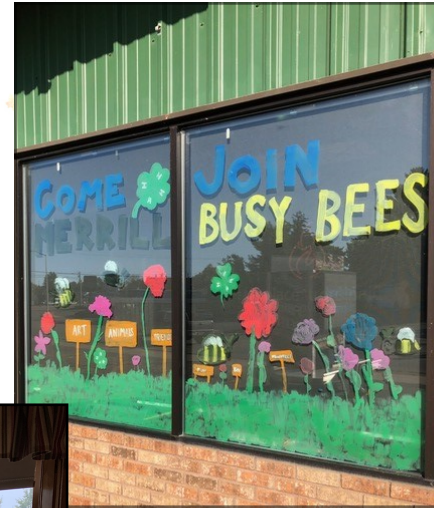
Merrill Busy Bees Merrill Sheet Metal

Thank you to everyone who promoted Lincoln County 4-H during National 4-H week!