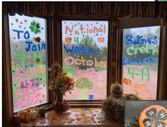
Barnes Creek Buccaneers Club X to C