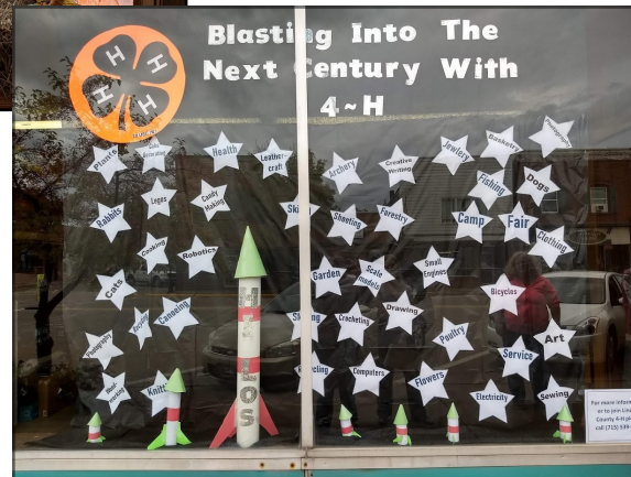
Hi Los Bumper to Bumper, Tomahawk