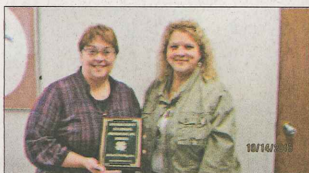
Reindl Printing receives a Friend of 4-H Award.