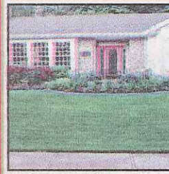
511 Lake Street

2402 E. MAIN ST., MERRILL, WI 54452 (715)536-8699 OR TOLL FREE 1-877-536-8842 www.merrillwirealestate.com